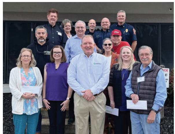
Representatives from Gilmer County receive funds for economic development, health care and other local nonprofits.