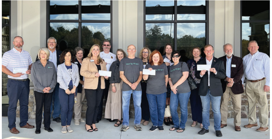
Representatives from Dawson and Lumpkin Chamber of Commerce offices, development authorities, food pantries and free health clinics are shown here receiving donations provided by unclaimed property funds.

Unclaimed funds are held for an additional five years, during which time you can claim any funds due you by providing a current mailing address. According to Georgia's unclaimed property laws, Amicalola EMC may then allocate the funds back to the communities it serves for the purpose of education, economic development and 501(c)(3) charities. Because of this, Amicalola EMC has